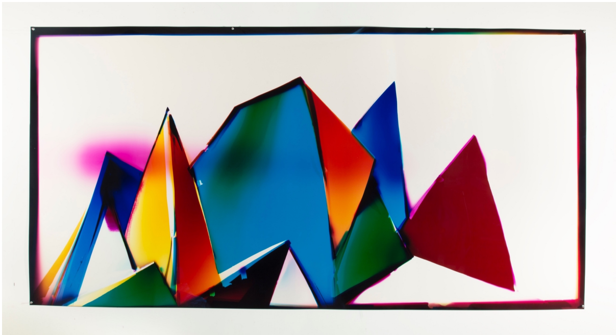
Mountain Jewels , 2018, Analogue Chromogenic Photogram, Unique, on Fujiflex, 50 x 100 inches

Black Box Projects, 10 Hanover Street, London W1S 1YG