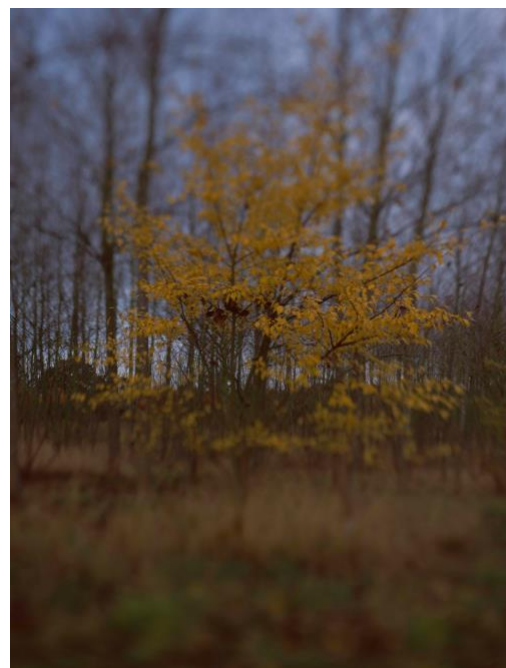
Steve Macleod, Black Schuck , 2012 Fuji Crystal Archive print 160 x 122 cm, edition of 3

Black Box Projects is a new art gallery in London which specialises in contemporary photography and contemporary art that is created using photographic materials. It currently represents Steve Macleod internationally and Liz Nielsen in the UK. For its first exhibition, the gallery will present a selection of work by Macleod and Nielsen at 15 Bateman Street, London W1D 3AQ from 6 – 10 March 2018.