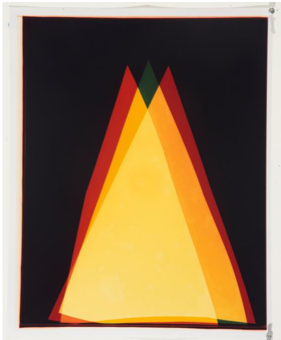
Liz Nielsen, Echoing Flame II , 2017 Analogue Chromogenic Photograph on Fuji Lustre 50.8 x 40.6 cm, unique

6 - 10 MARCH 2018 15 BATEMAN STREET, LONDON W1