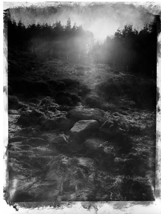
On Boundary Stones, 1992-2005 Silver gelatin print with black oil stick 40.6 x 30.5 cm