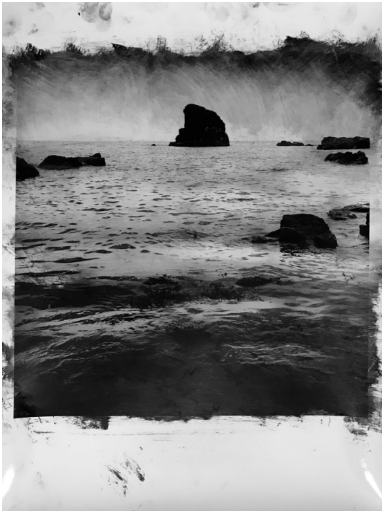
Off Far Rock, 1992 - 2005 Silver gelatin print with oil stick 40.6 x 30.5 cm